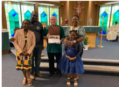
September-The Adjoyi Family