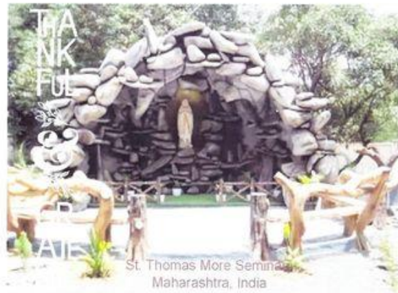
St. Thomas More Seminary Maharashtra, India

The amount was given to the Rector of the seminary, back in India and he used it towards their noble project of building a grotto of our lady, mother Mary in front of the seminary! This will be a place primarily for