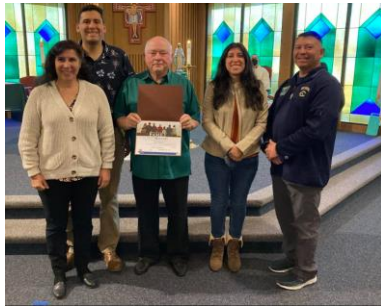
August-The Rivera Family